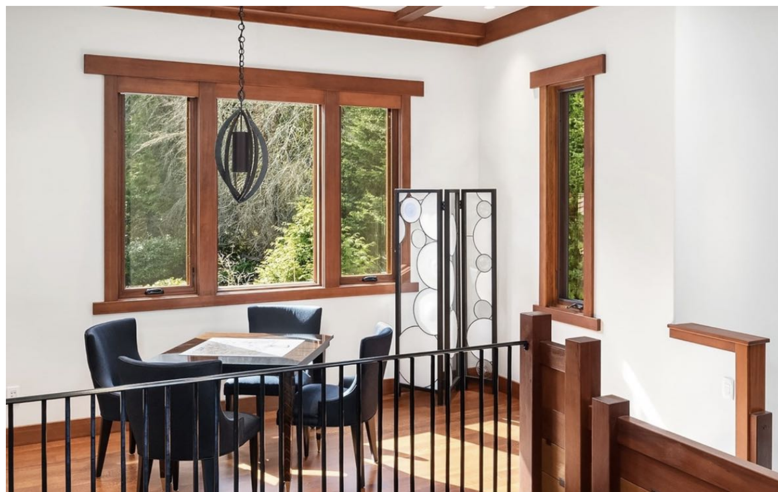
4 EXISTING WINDOW REFERENCE IMAGE Scale: NOT TO SCALE